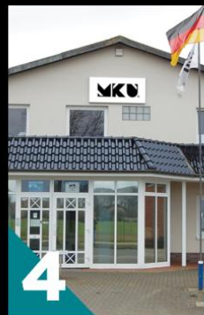
MKU GmbH Sittensen, GERMANY