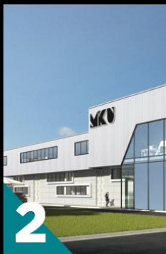
Rooha, Uttar Pradesh, INDIA