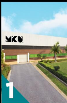
Malwan, Uttar Pradesh, INDIA