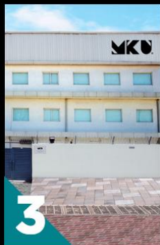
Kanpur, Uttar Pradesh, INDIA